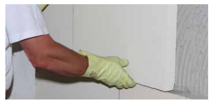
A Next, the KÖSTER Hydrosilicate Boards are pressed onto the wall and leveled. The boards and the butted joints must be completely glued.