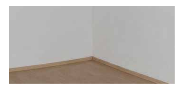
In normal room conditions and with good air circulation the surface can be decorated after 24 hours with breathable materials.