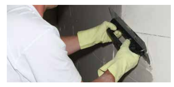
Afterwards, the whole area is plastered with a layer of KÖSTER Hydrosilicate Adhesive SK in a maximum thickness of 2 mm.