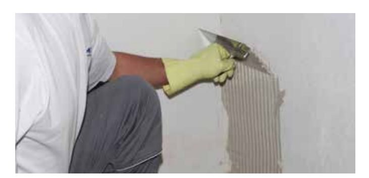
The adhesive is then applied to the substrate with a 8 mm notched trowel, fully covering the board area.